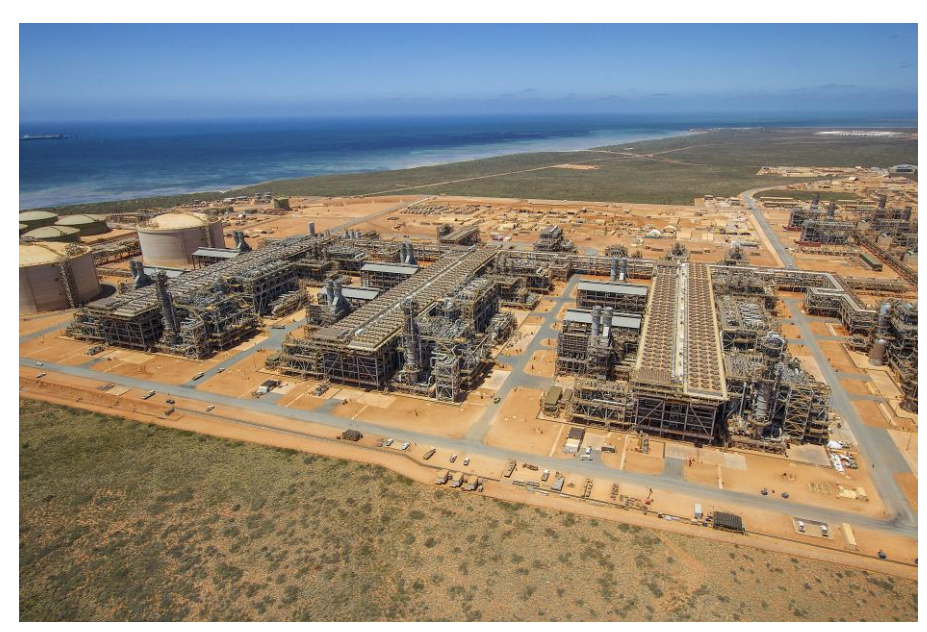
Chevron Australia Pty Ltd