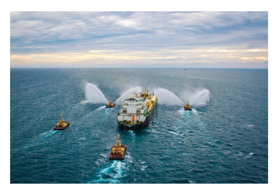
Chevron Australia Pty Ltd